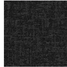
FAST LANE 6770