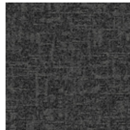
FAST LANE 6778