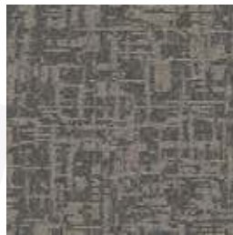
FAST LANE 6776