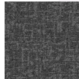
FAST LANE 6779