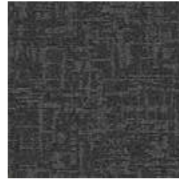
FAST LANE 678