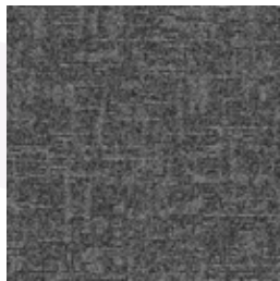
FAST LANE 6774