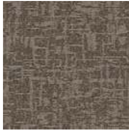
FAST LANE 647